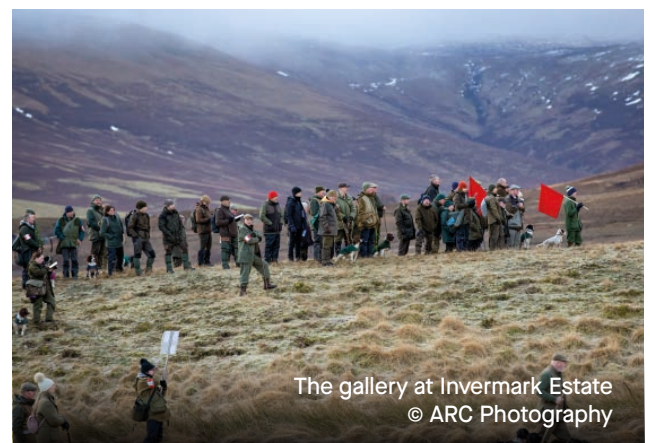
The gallery at Invermark Estate