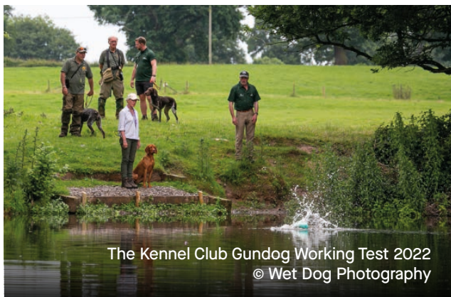
The Kennel Club Gundog Working Test 2022