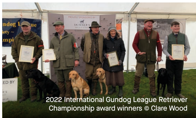
2022 International Gundog League Retriever Championship award winners

All of the dogs in the awards demonstrated these qualities over the three days of the trial as other very talented dogs fell by the wayside. And, possibly above all others, the quality that shone through in these dogs was their temperament, their willingness to respond to their handlers' commands and to continue to work with them as a team.