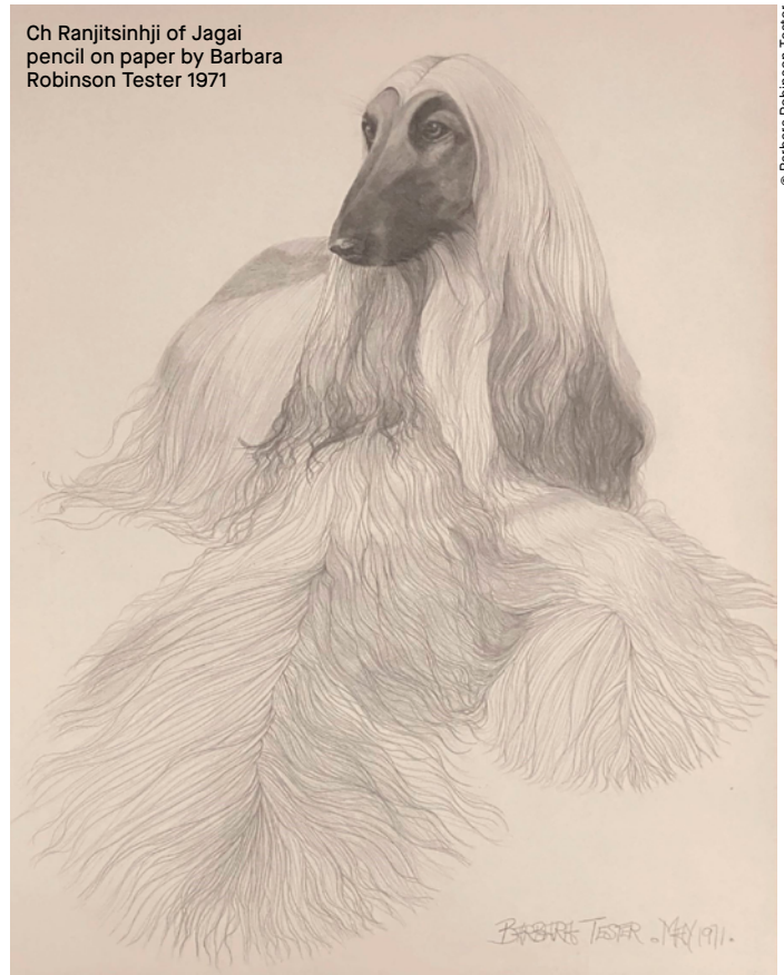
Ch Ranjitsinhji of Jagai pencil on paper by Barbara Robinson Tester 1971

The exhibitions opened on 9 October 2024, and will remain until 25 April 2025