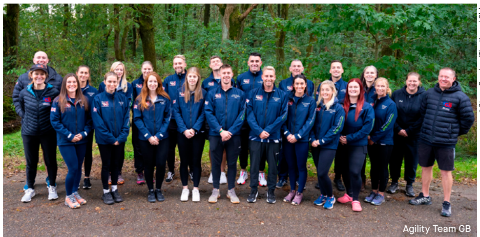
Agility Team GB

“The management team are thrilled with the performances from this year’s team”