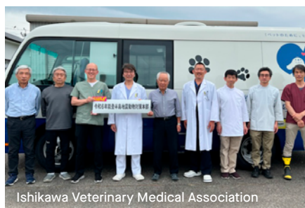
Ishikawa Veterinary Medical Association